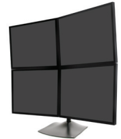
DS100 Quad-Monitor Desk Stand